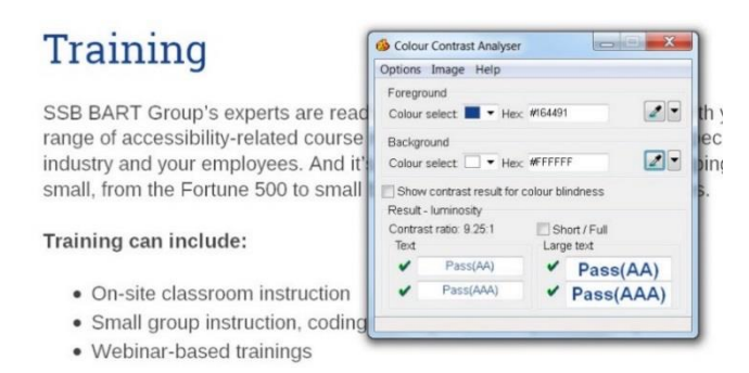
Figure 5: Blue text against a white background provides sufficient contrast, with a luminosity contrast ratio of 9.25:1.

Text less than 18 point or bold text less than 14 point must have a luminosity contrast ratio of 4.5:1 or more. Text 18 point or larger or bold text 14 point or larger must have a luminosity contrast ratio of 3:1 or more.