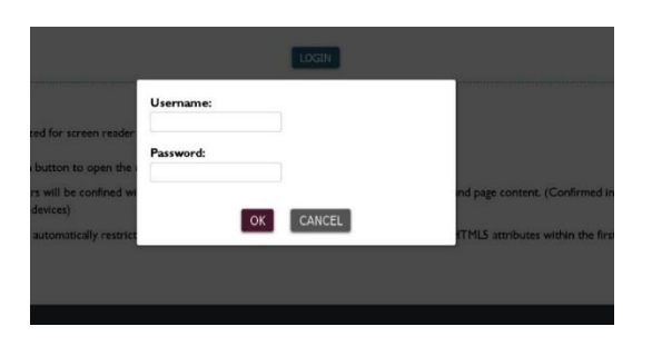
Figure 21: Log In dialog with role="dialog" and aria-labelledby to provide a label for the dialog.