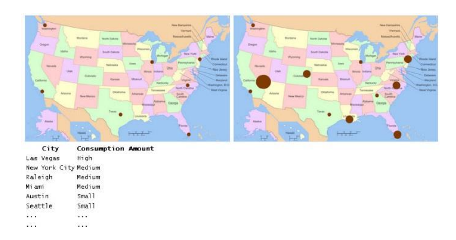
Figure 2: Complex images require a description of the image along with alternative text to provide context to the image