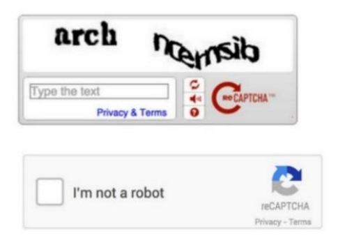
Figure 15: Google's reCAPTCHA provides audio and visual support for user input.