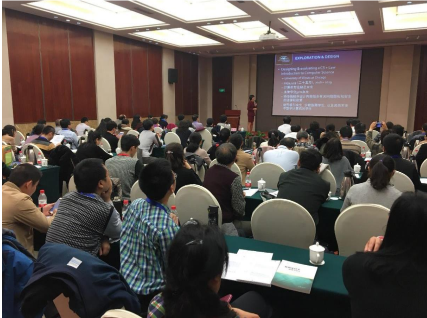
Panel Discussion on IT2017, Hong Kong, December 12-14, 2017

The workshop attracted more than 100 attendees and the audience feedback was very positive.